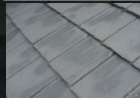
Old Flat Charcoal Gray Shake